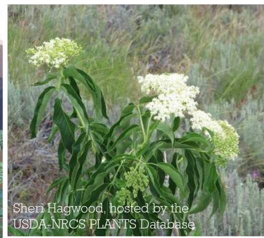
Sheri Hagwood, hosted by the USDA-NRCS PLANTS Database